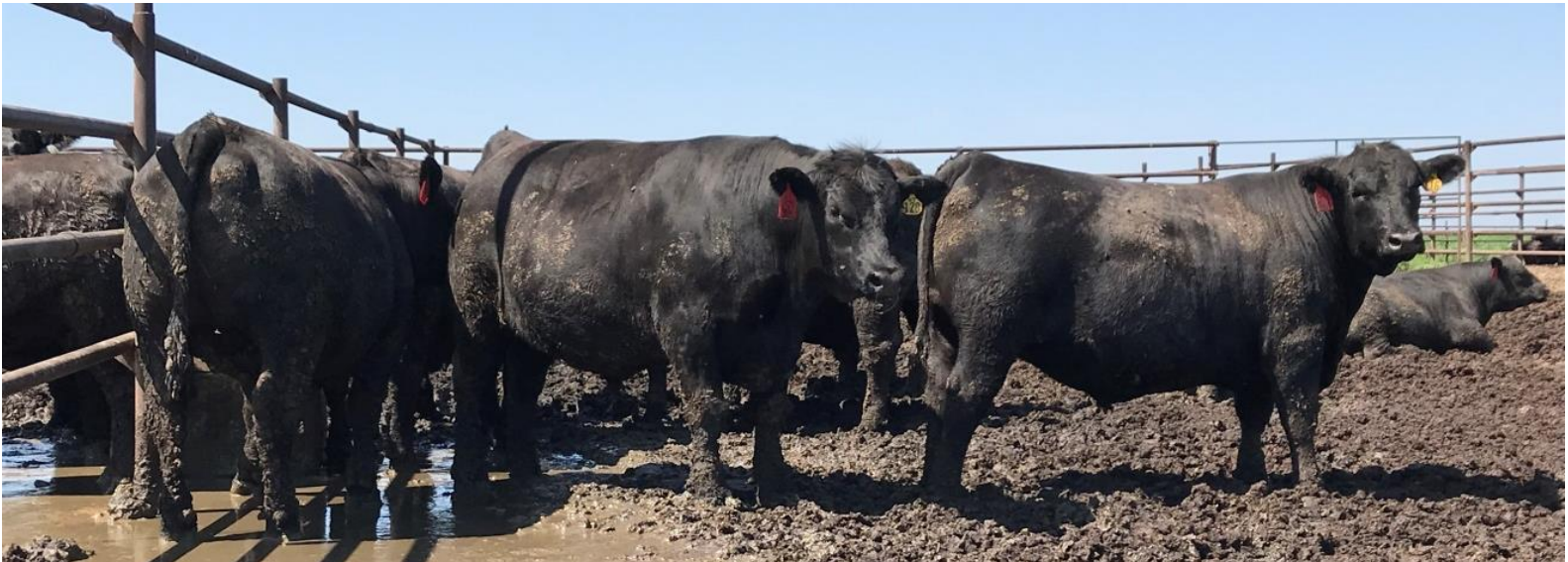
Dalebanks steers on feed at Tiffany Cattle Co this summer (after a rare, but much-appreciated rain).

Join us in November, and see for yourself what Dalebanks Practical. Profitable. Genetics. can do for your herd.